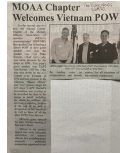
The Yulee News 28 Sep