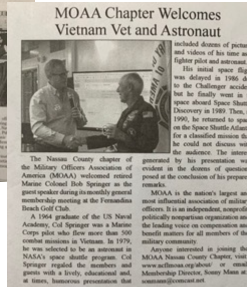
Article in Westside Journal, 23 Mar