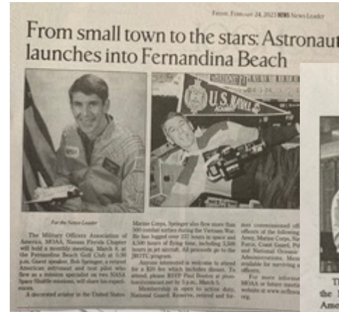
Article from FB N-L, 24 Feb